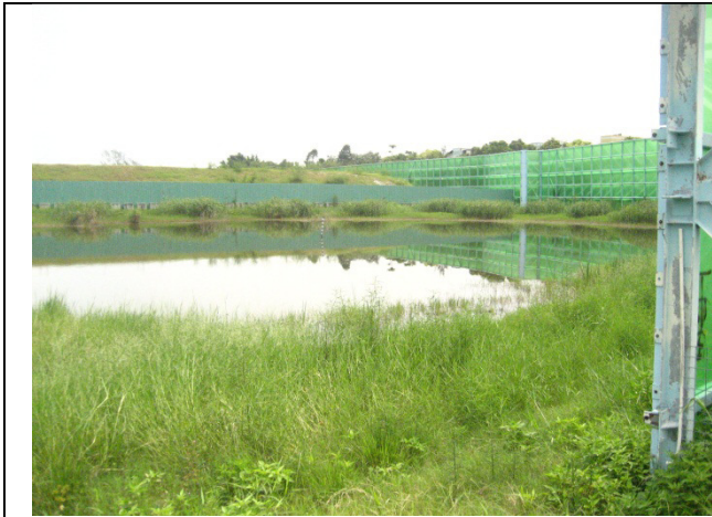
Photo 1: The Construction works have been screened by hoarding (CM2)