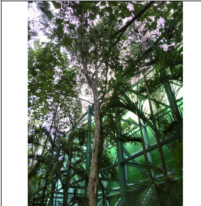
Photo 3: Continuous belt of screen planting along the southern and western boundaries of the site has been completed. (CM6)