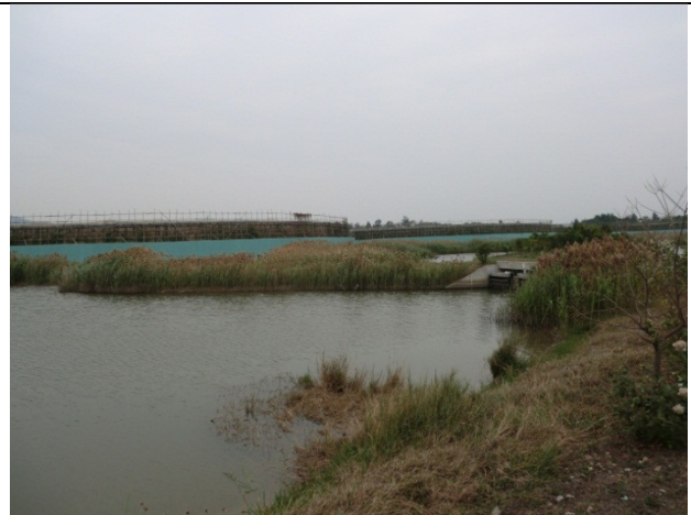
Photo 2: The wetland areas are being established, with the ponds are being seasonally filled with rain water. (CM2)