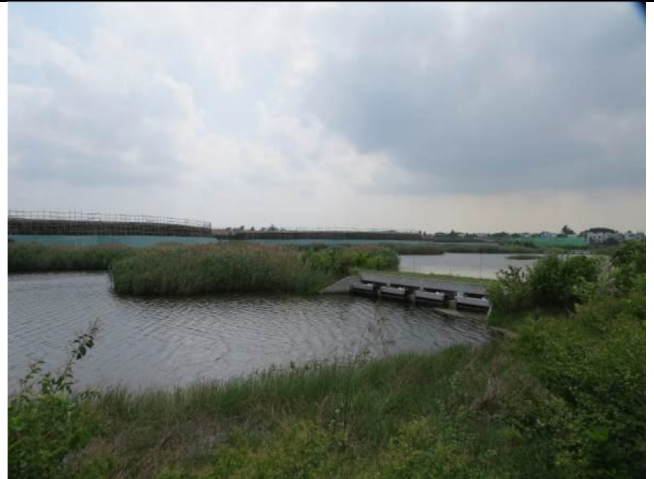
Photo 2: The wetland areas are being established, with the ponds are being seasonally filled with rain water. (CM2)