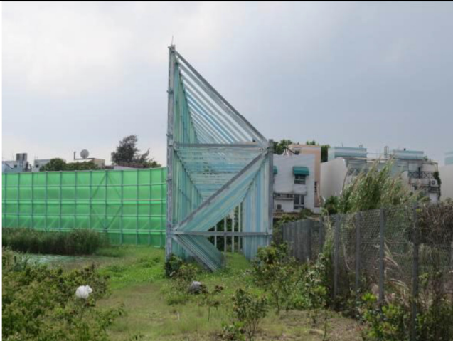
Photo 1: The Construction works have been screened by hoarding (CM2)