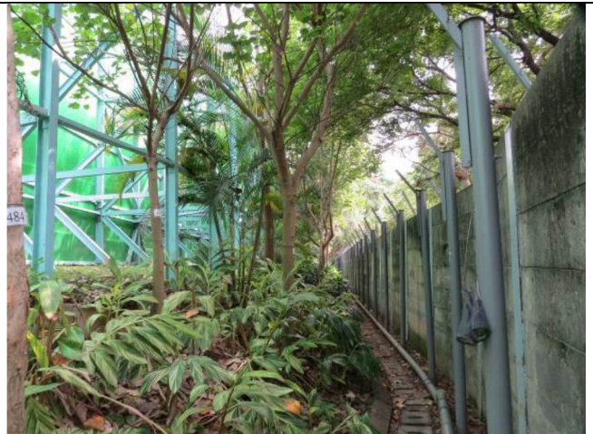
Photo 4: Advance screen planting of noise barrier has been undertaken (CM6)