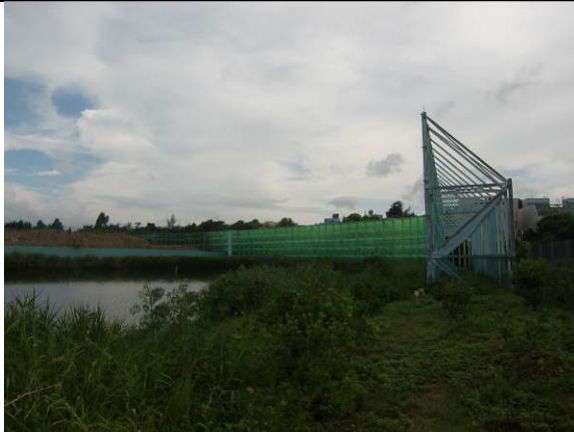
Photo 1: The Construction works have been screened by hoarding (CM2)