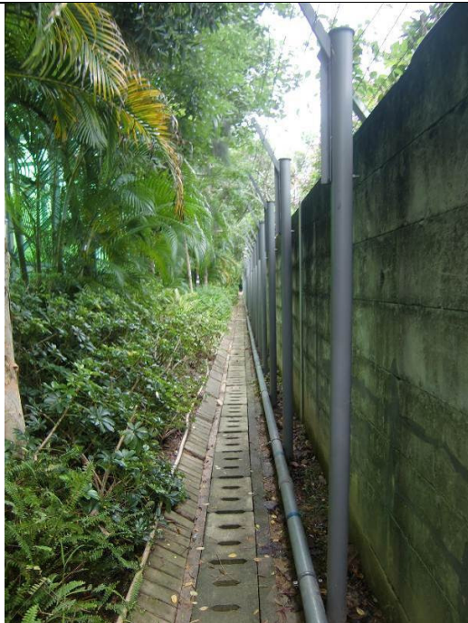
Photo 3: Continuous belt of screen planting along the southern and western boundaries of the site has been completed. (CM6)