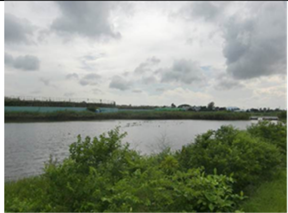
Photo 2: The wetland areas are being established, with the ponds are being seasonally filled with rain water. (CM2)