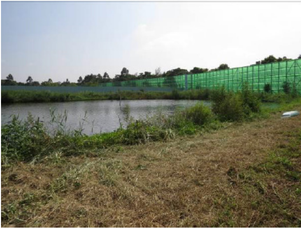
Photo 1: The Construction works have been screened by hoarding / noise barriers. (CM2)