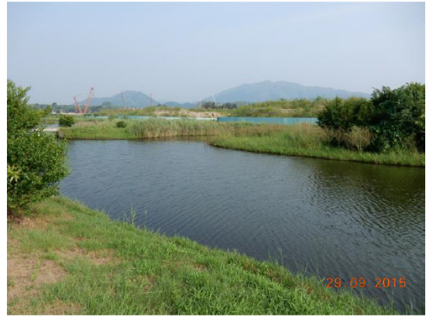
Photo 2: The wetland areas are being established, with the ponds are being seasonally filled with rain water.(CM2)