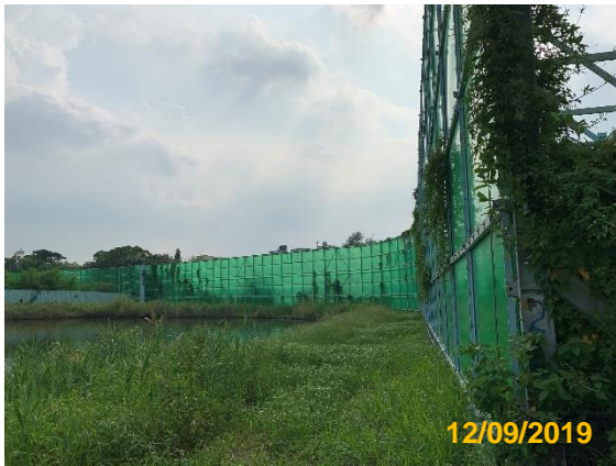
Photo 1: The Construction works have been screened by hoarding / noise barriers. (CM2)