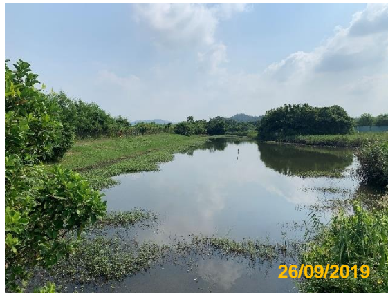
Photo 2: The wetland areas are being established, and the ponds are being seasonally filled with rain water. (CM2)