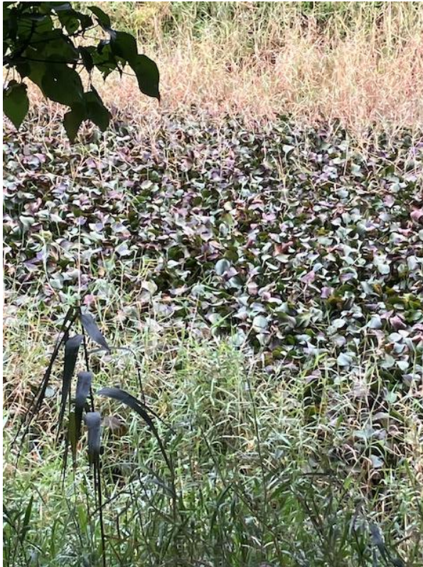
Photo 20 Appearance of the water body at MP6 on 12 February 2025