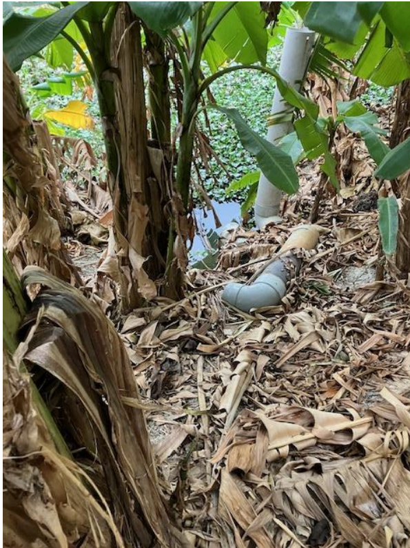
Photo 16 Appearance of the water body at MP5 on 12 February 2025