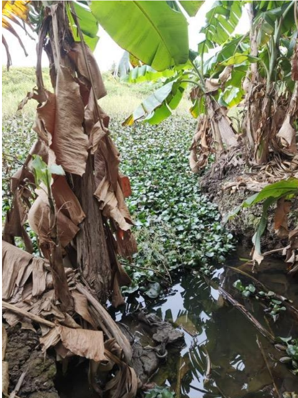
Photo 18 Appearance of the water body at MP6 on 1 February 2025