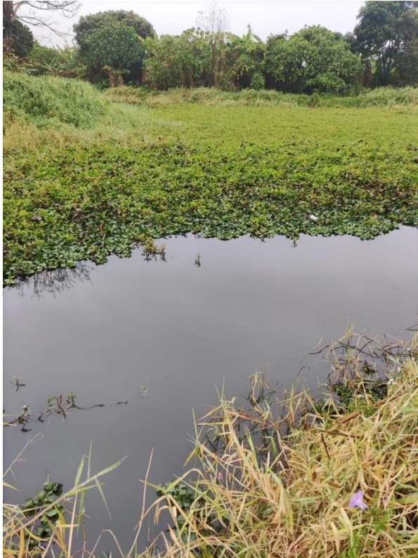
Photo 14 Appearance of the water body at MP4 on 14 February 2025