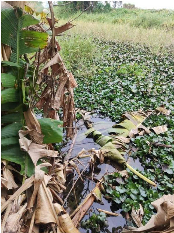
Photo 22 Appearance of the water body at MP6 on 28 February 2025