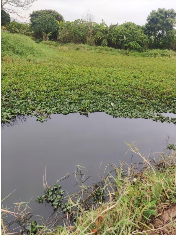
Photo 12 Appearance of the water body at MP4 on 10 February 2025