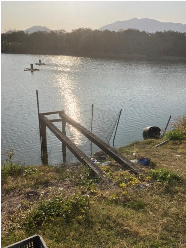
Photo 6 Appearance of the water body at MP3 on 12 February 2025