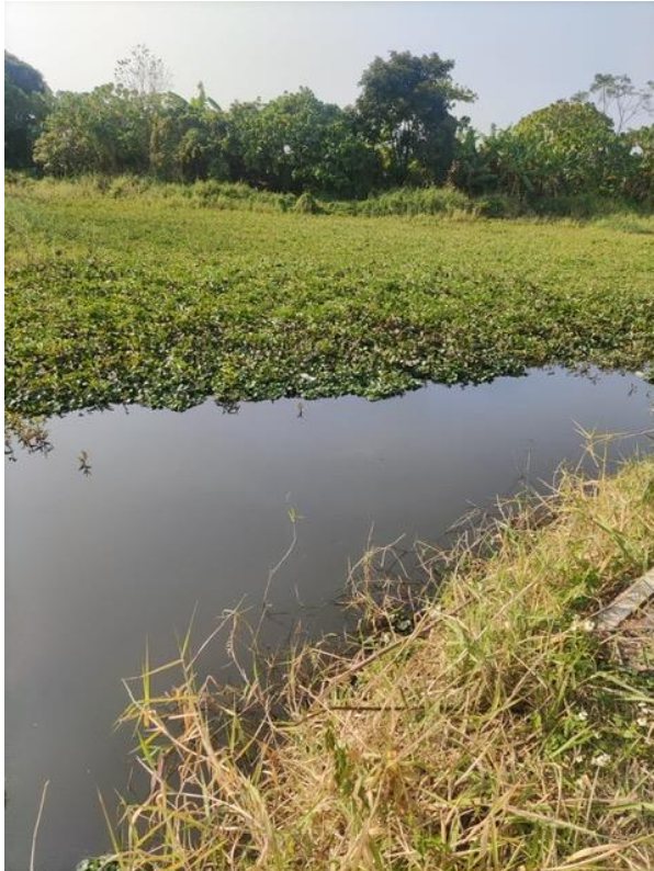
Photo 10 Appearance of the water body at MP4 on 5 February 2025