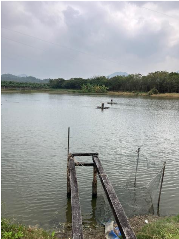
Photo 8 Appearance of the water body at MP4 on 1 February 2025