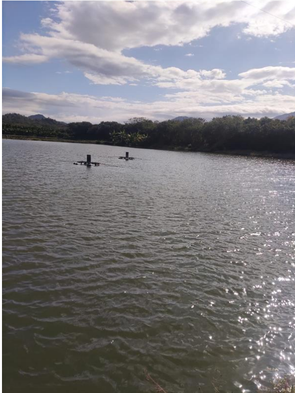
Photo 4 Appearance of the water body at MP3 on 3 February 2025