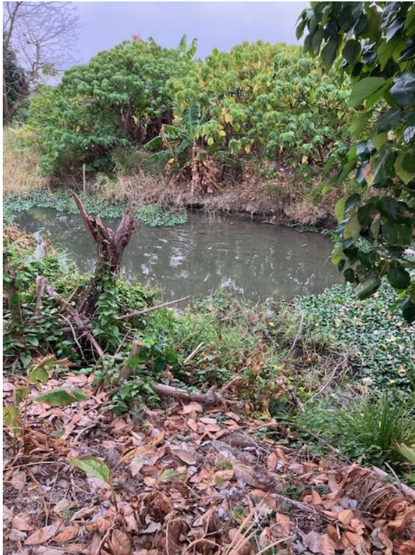
Photo 14 Appearance of the water body at MP4 on 19 February 2025