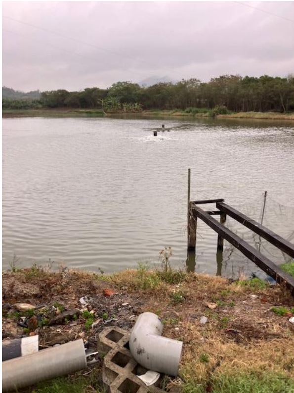
Photo 8 Appearance of the water body at MP4 on 3 March 2025