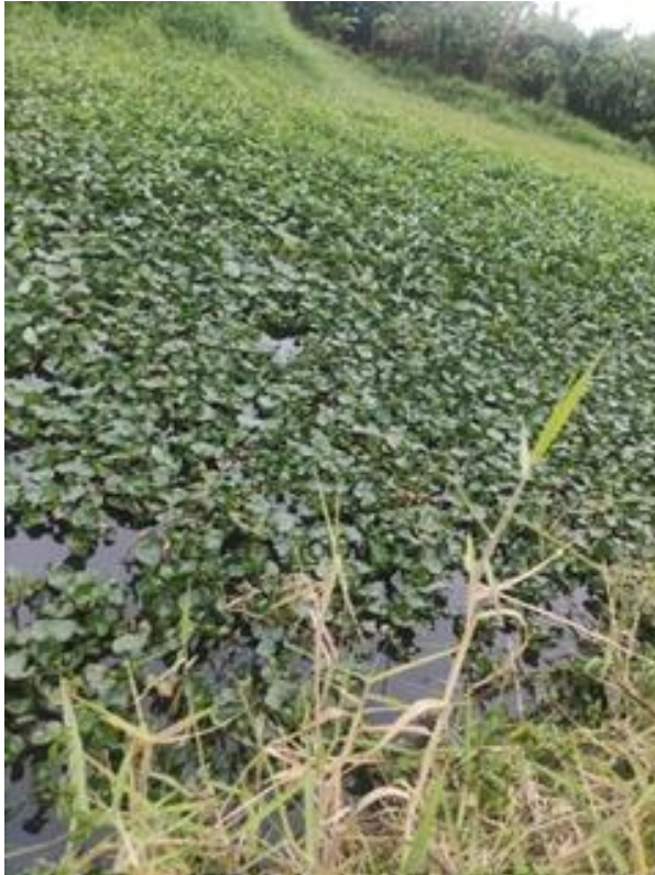
Photo 14 Appearance of the water body at MP4 on 31 March 2025