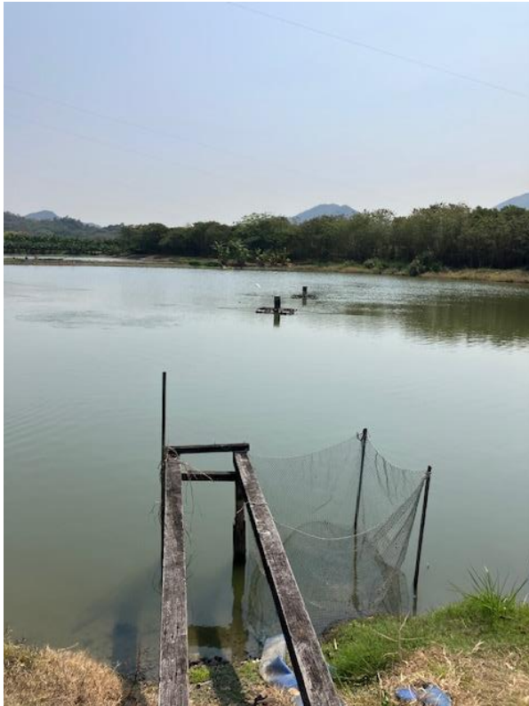
Photo 6 Appearance of the water body at MP3 on 28 March 2025