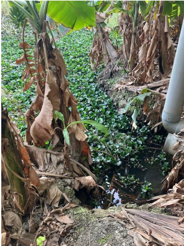
Photo 16 Appearance of the water body at MP5 on 24 March 2025