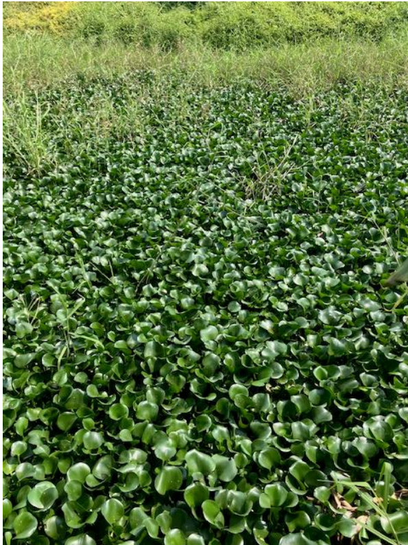
Photo 18 Appearance of the water body at MP6 on 5 March 2025