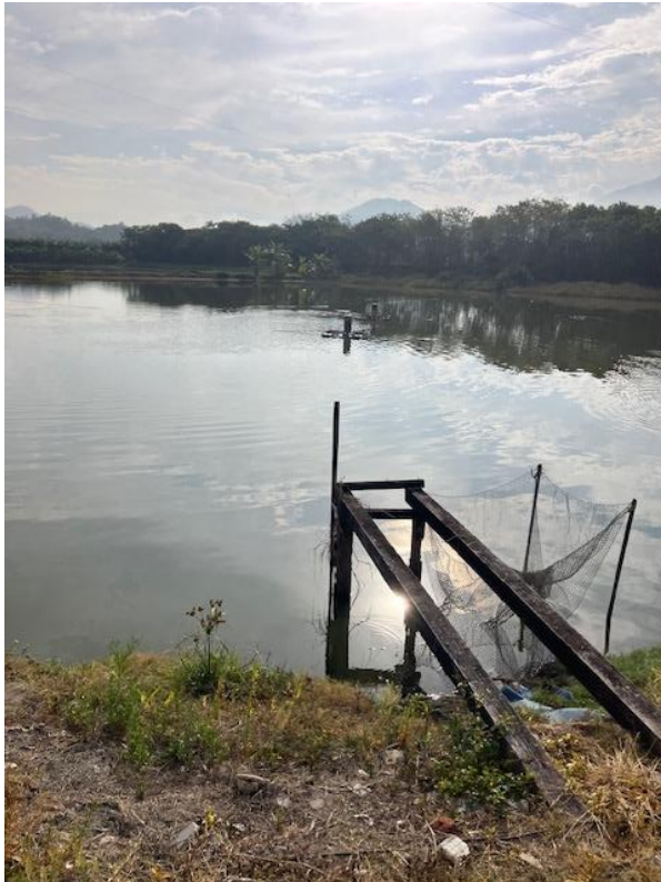
Photo 4 Appearance of the water body at MP3 on 5 March 2025