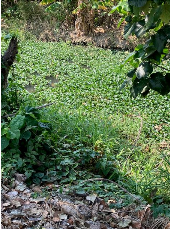
Photo 12 Appearance of the water body at MP4 on 26 March 2025