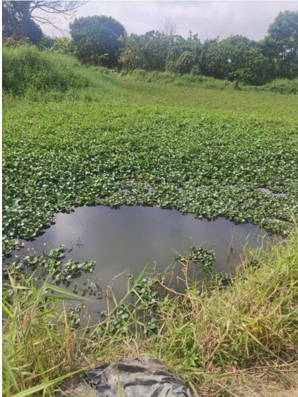
Photo 10 Appearance of the water body at MP4 on 17 March 2025