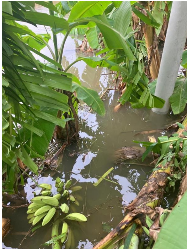
Appearance of the water body at MP5 on 21 July 2025