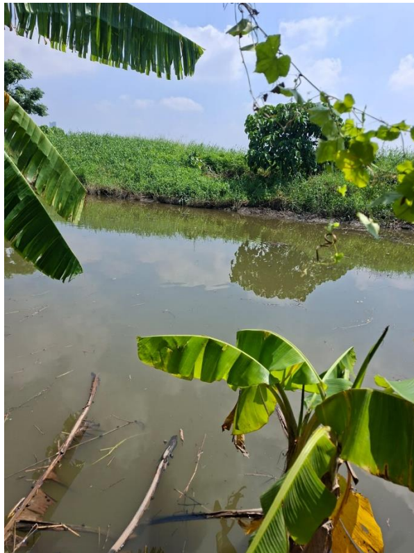
Appearance of the water body at MP6 on 25 July 2025