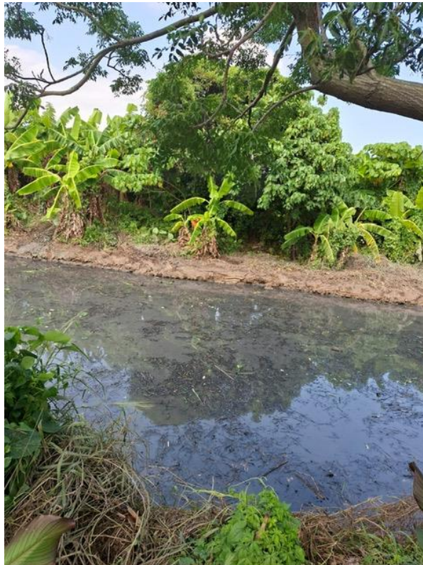
Photo 18 Appearance of the water body at MP4 on 9 July 2025