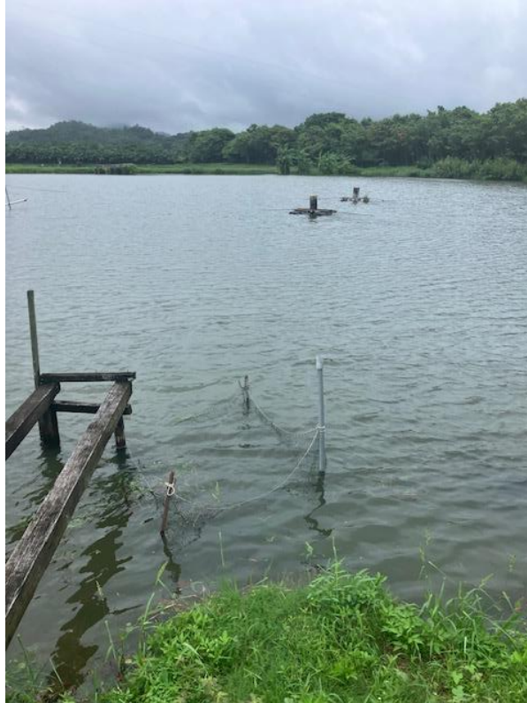
Photo 12 Appearance of the water body at MP3 on 23 July 2025