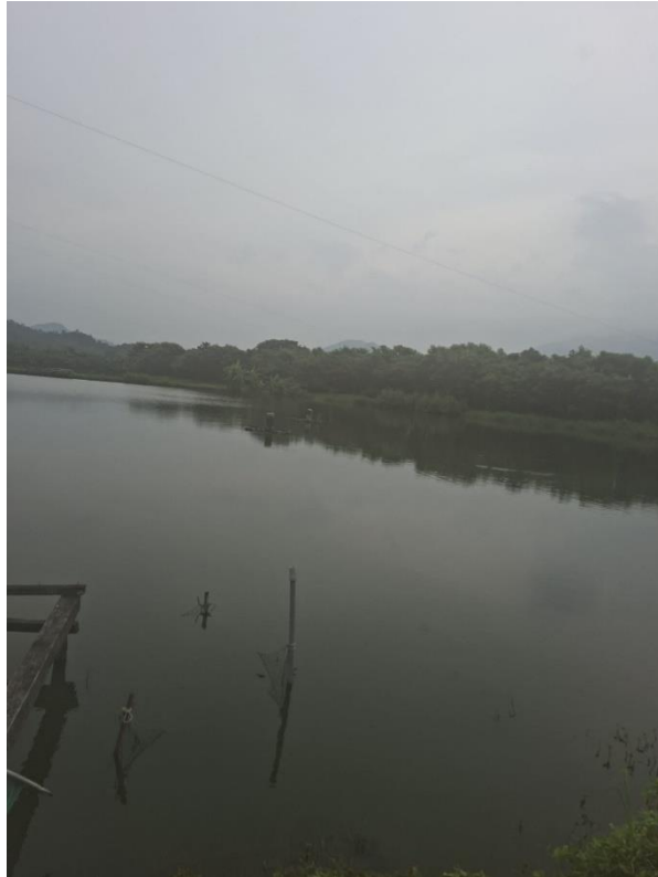
Photo 16 Appearance of the water body at MP4 on 2 July 2025