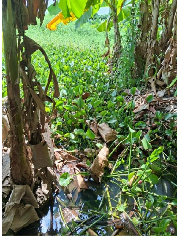
Photo 24 Appearance of the water body at MP5 on 7 July 2025