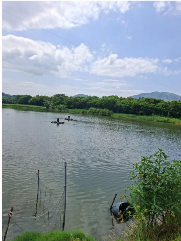
Appearance of the water body at MP3 on 4 July 2025