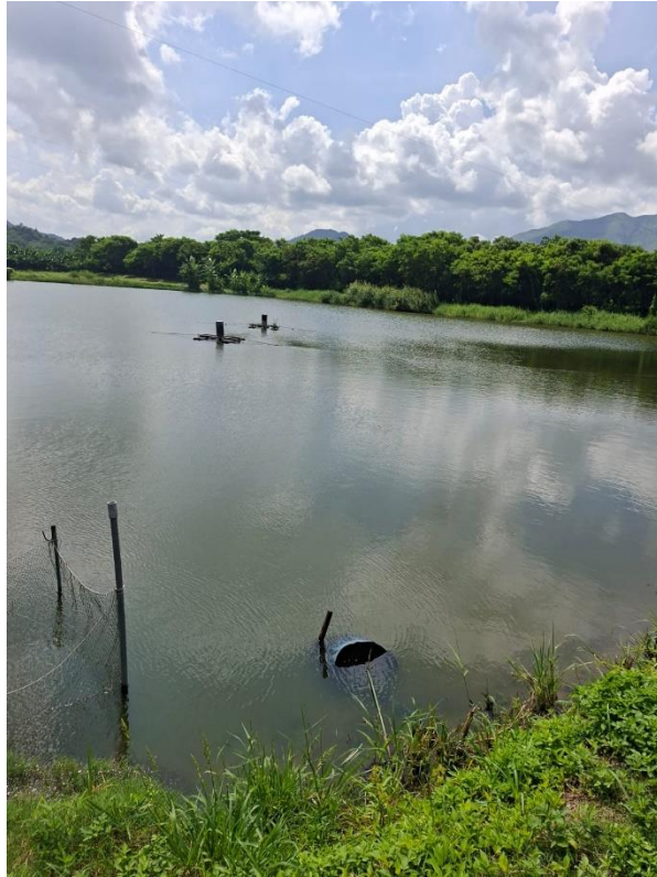
Photo 10 Appearance of the water body at MP3 on 18 July 2025