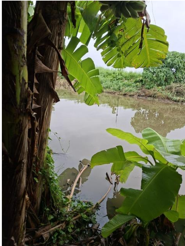
Appearance of the water body at MP6 on 11 July 2025