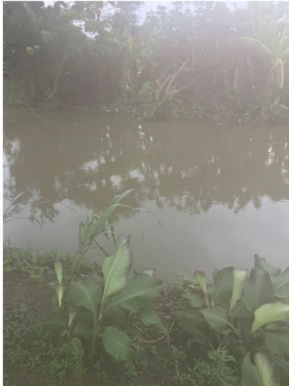
Photo 22 Appearance of the water body at MP5 on 2 July 2025