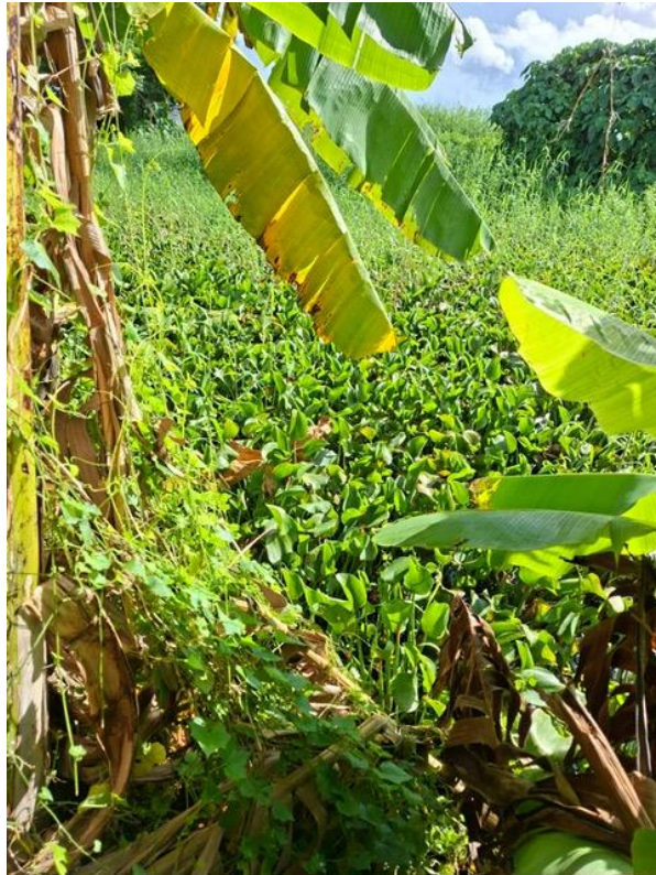
Appearance of the water body at MP6 on 2 July 2025