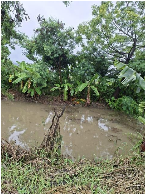
Photo 20 Appearance of the water body at MP4 on 14 July 2025