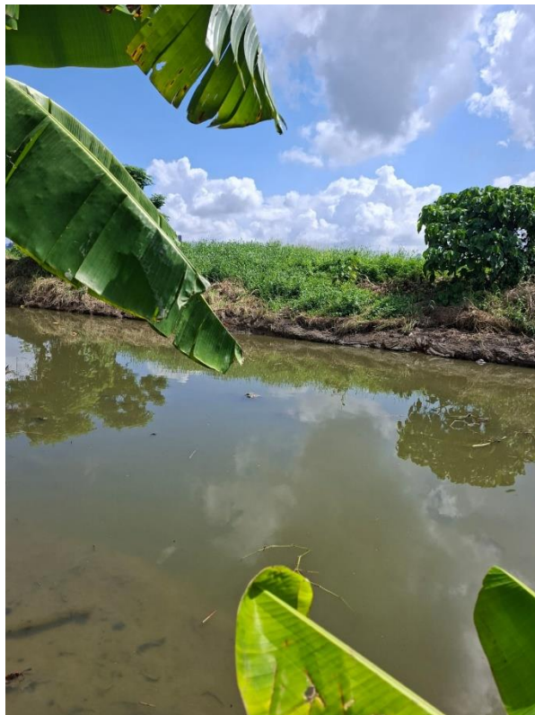
Appearance of the water body at MP6 on 16 July 2025