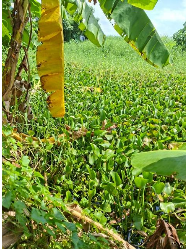
Photo 34 Appearance of the water body at MP6 on 7 July 2025