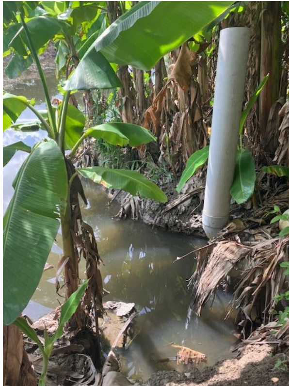
Photo 28 Appearance of the water body at MP5 on 16 July 2025