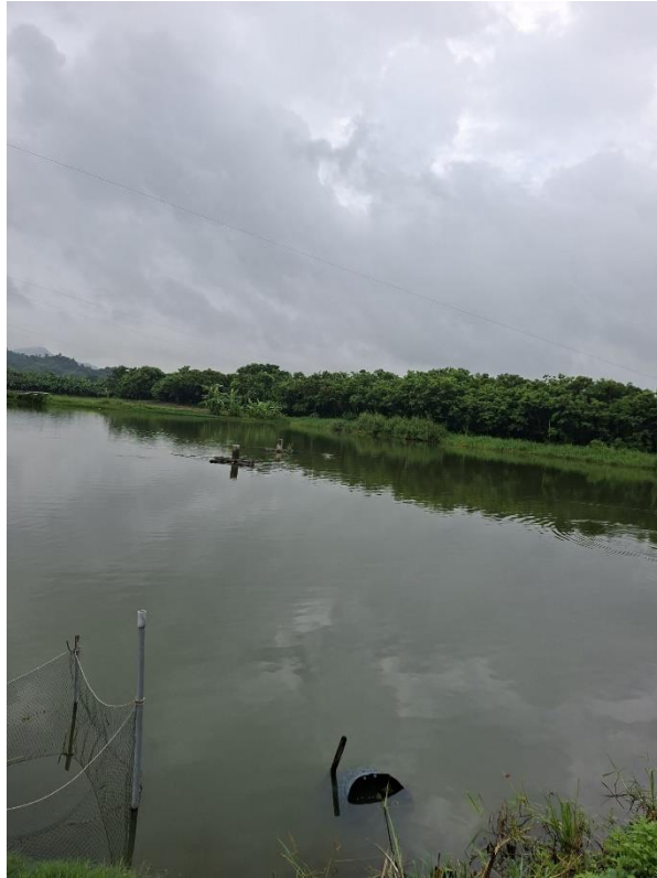
Photo 8 Appearance of the water body at MP3 on 14 July 2025