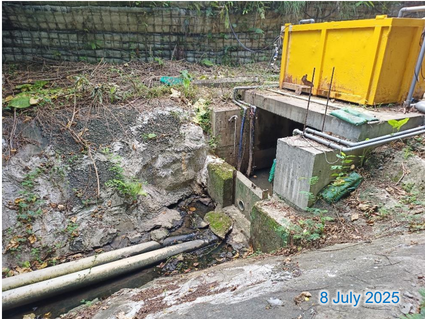
Photo 2 Wastewater treatment facilities (AquaSed, sedimentation tanks) inside the site (near discharge outlet to the northern ditches)