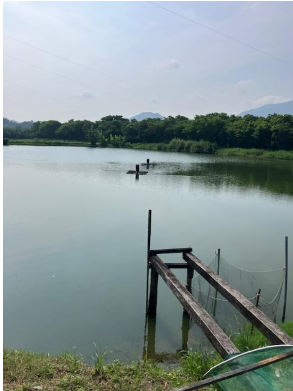
Photo 6 Appearance of the water body at MP3 on 9 July 2025