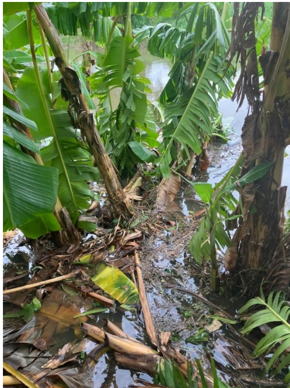
Appearance of the water body at MP6 on 21 July 2025