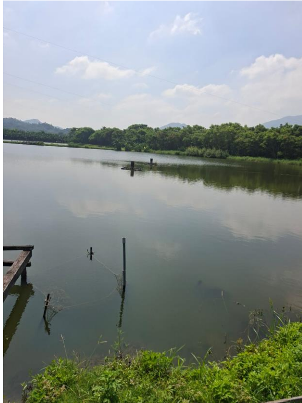
Photo 14 Appearance of the water body at MP3 on 28 July 2025