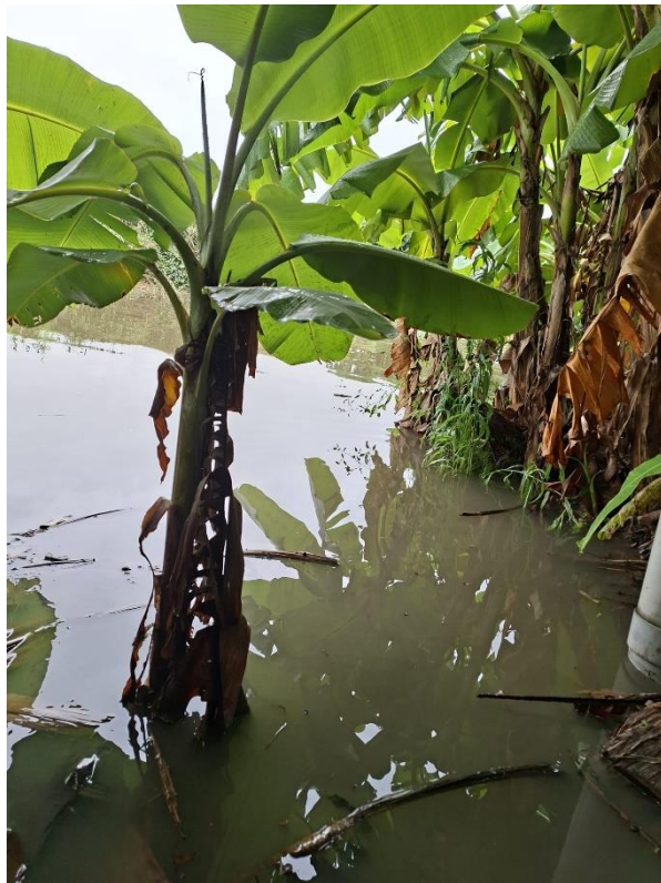
Appearance of the water body at MP5 on 11 July 2025