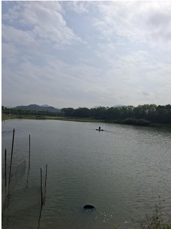
Photo 4 Appearance of the water body at MP3 on 4 March 2026