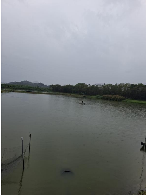
Photo 16 Appearance of the water body at MP4 on 9 March 2026