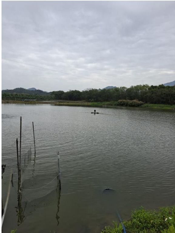
Photo 6 Appearance of the water body at MP3 on 9 March 2026