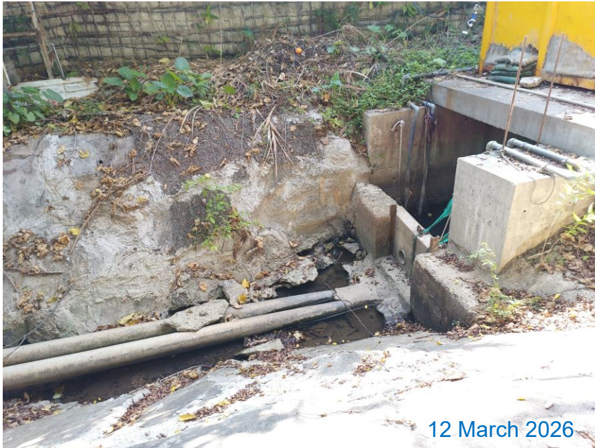
Photo 2 Wastewater treatment facilities (AquaSed, sedimentation tanks) inside the site (near discharge outlet to the northern ditches)