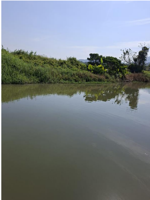
Photo 26 Appearance of the water body at MP6 on 16 March 2026