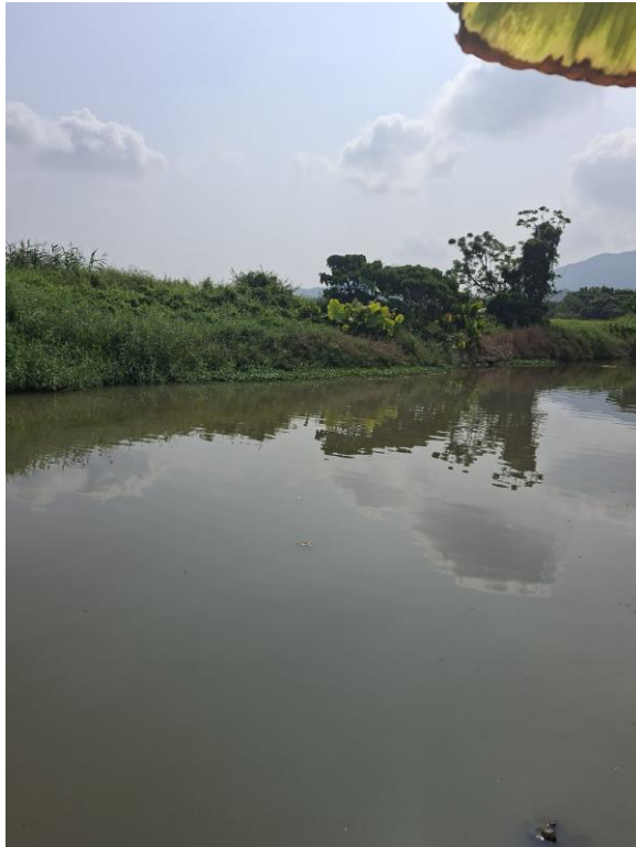
Photo 30 Appearance of the water body at MP6 on 27 March 2026