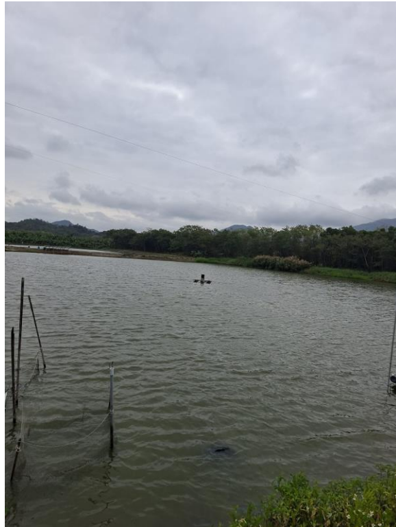
Photo 12 Appearance of the water body at MP3 on 23 March 2026