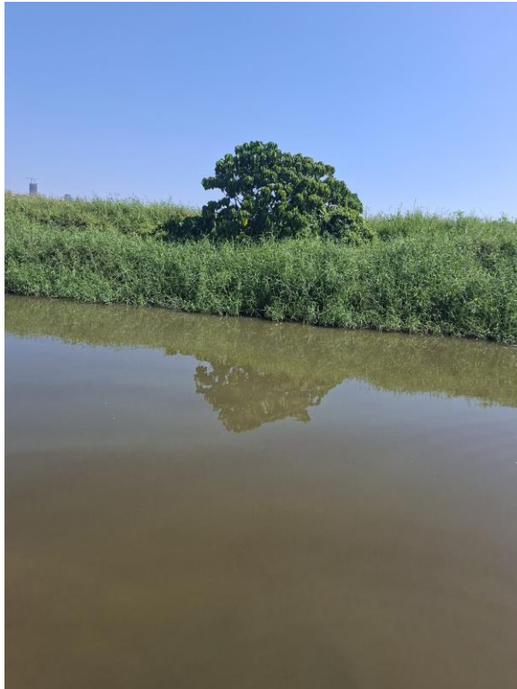
Photo 20 Appearance of the water body at MP5 on 20 March 2026