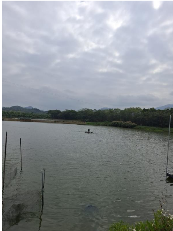
Photo 8 Appearance of the water body at MP3 on 13 March 2026