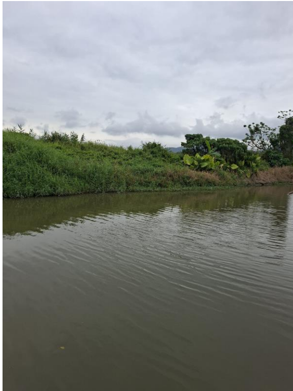
Photo 28 Appearance of the water body at MP6 on 23 March 2026