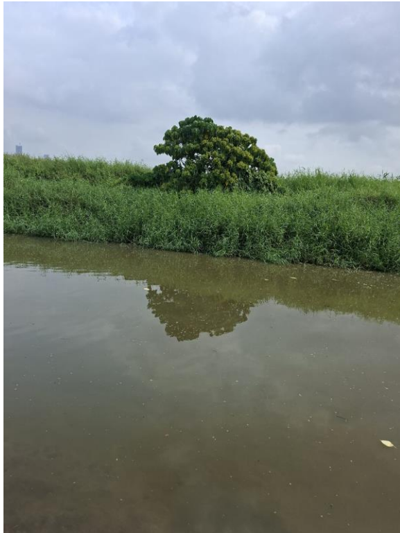
Photo 24 Appearance of the water body at MP5 on 30 March 2026