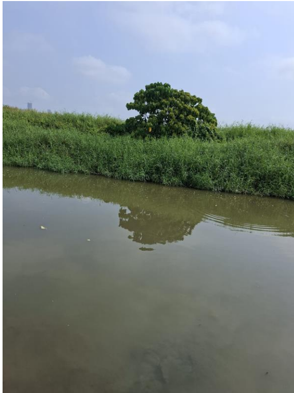
Photo 22 Appearance of the water body at MP5 on 25 March 2026