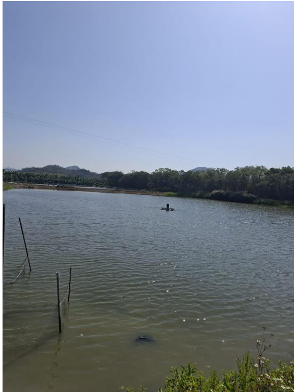
Photo 10 Appearance of the water body at MP3 on 18 March 2026