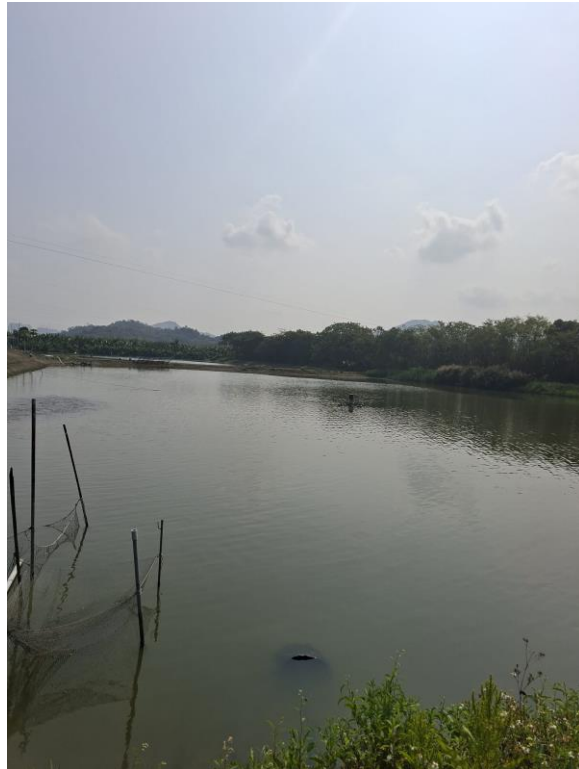
Photo 14 Appearance of the water body at MP3 on 27 March 2026