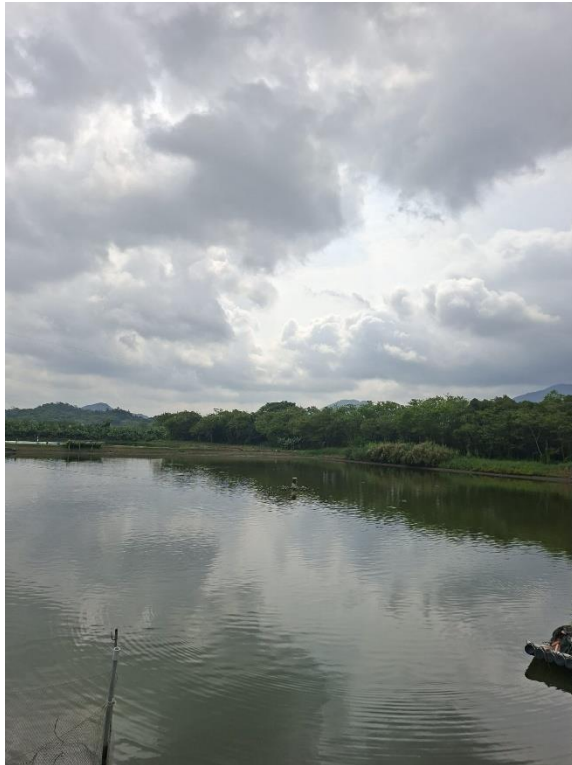
Photo 14 Appearance of the water body at MP4 on 1 April 2026