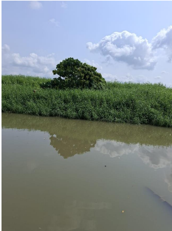
Photo 28 Appearance of the water body at MP6 on 24 April 2026