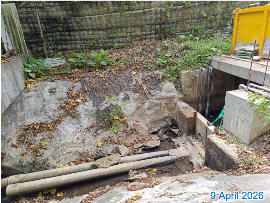
Photo 2 Wastewater treatment facilities (AquaSed, sedimentation tanks) inside the site (near discharge outlet to the northern ditches)