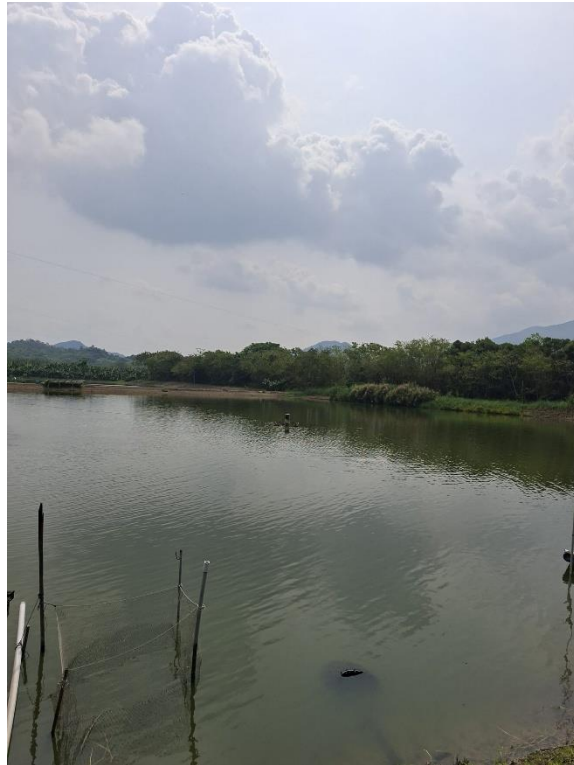
Photo 10 Appearance of the water body at MP3 on 22 April 2026