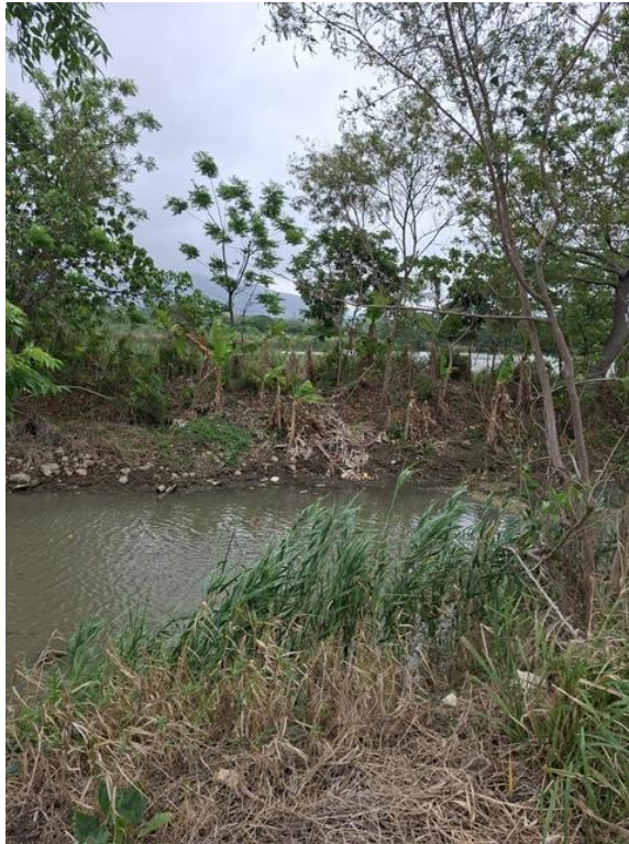
Photo 16 Appearance of the water body at MP4 on 13 April 2026