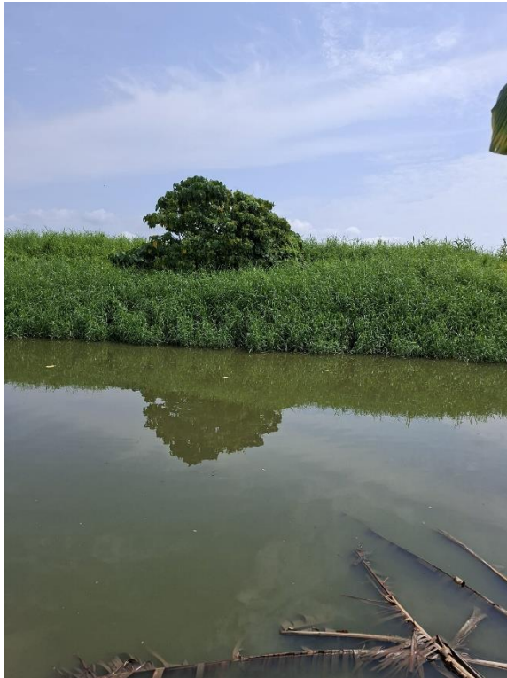
Photo 30 Appearance of the water body at MP6 on 29 April 2026