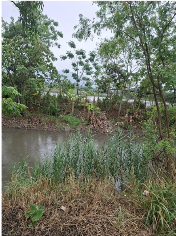
Photo 20 Appearance of the water body at MP5 on 1 April 2026