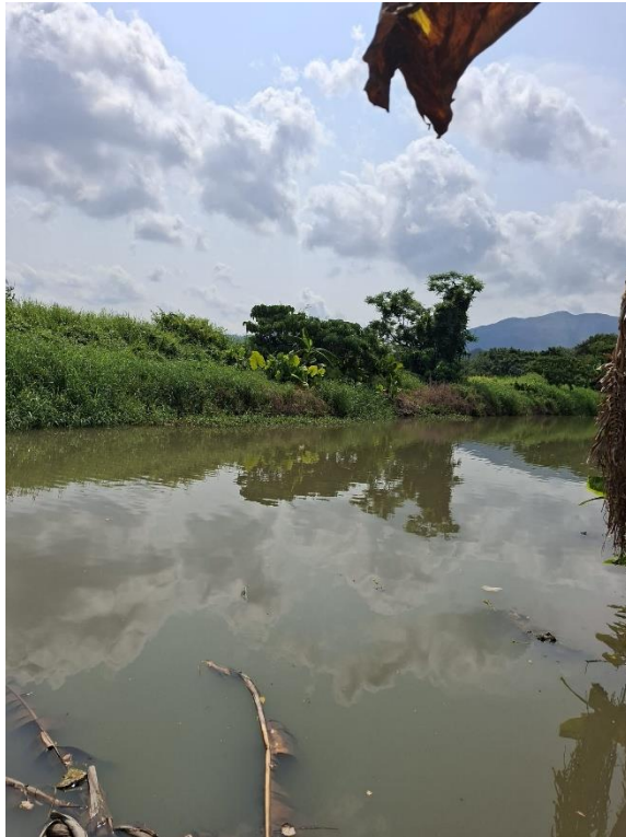
Photo 24 Appearance of the water body at MP6 on 1 April 2026