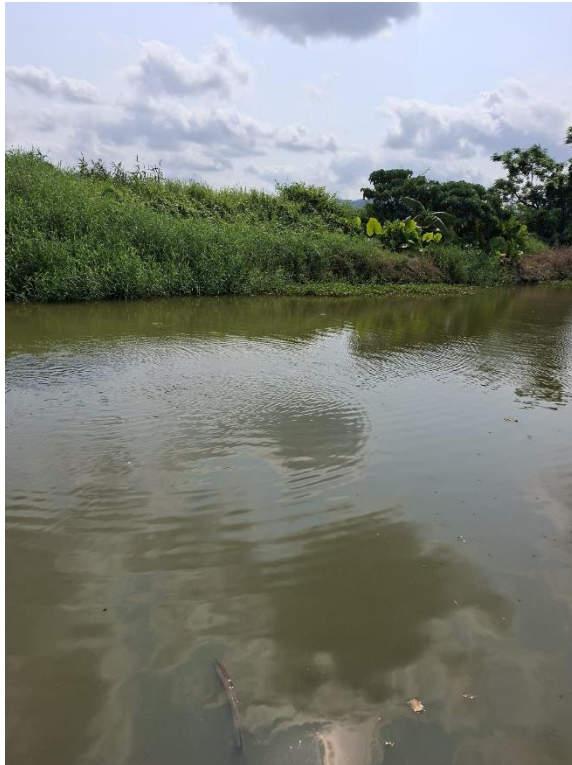
Photo 22 Appearance of the water body at MP5 on 20 April 2026