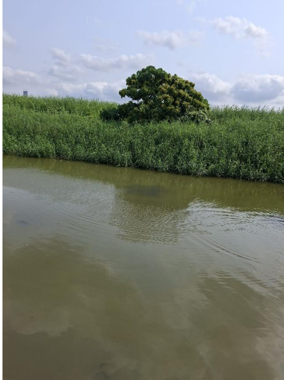
Photo 26 Appearance of the water body at MP6 on 20 April 2026