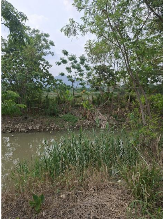
Photo 18 Appearance of the water body at MP4 on 22 April 2026