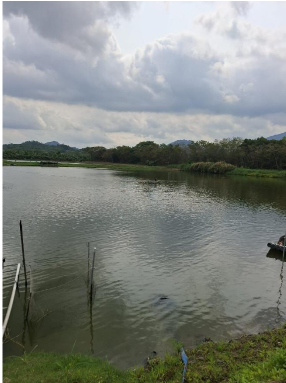
Photo 8 Appearance of the water body at MP3 on 17 April 2026