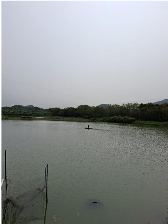
Photo 4 Appearance of the water body at MP3 on 8 April 2026