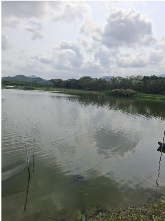
Photo 6 Appearance of the water body at MP3 on 13 April 2026